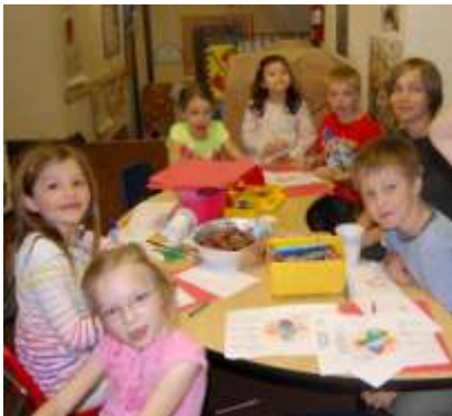
ABC Schützen 1 having fun

young as 12 months up to 12 years. At the beginning of the school year, the students are divided into small age groups and remain