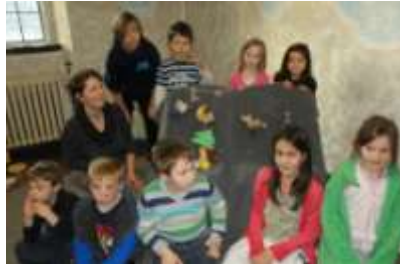
ABC Schützen 1 performing the Bremer Stadtmusikanten in 2011

there throughout the year. The one to three-year-olds and their caregiver