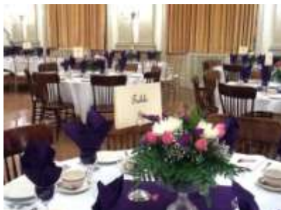
Our ballroom set-up for the Stiftungsfest

In spring of each year, a special German Society committee gears up in preparation for the annual Stiftungsfest, a gala commemorating the founding of the German Society of Pennsylvania in the year 1764. This year the event will take place on Saturday, November 9.