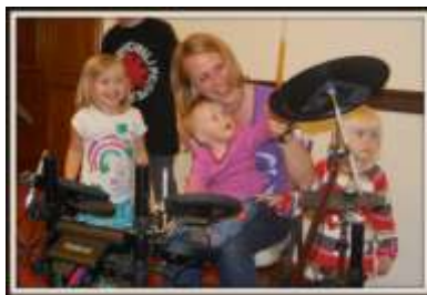
Everyone got a turn on the drums

A different kind of hands-on project took place when a scientist parent volunteered to run a science experiment with the children. Using dry ice, they learned about the states of matter (gas, liquid and solid). They created hypotheses and performed experiments to understand the differences in the densities of gas. The highlight was being able to play with their own cup of dry ice in water. To