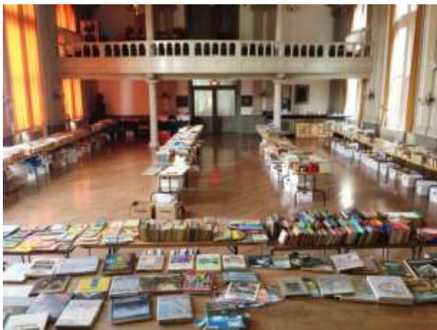
Our Auditorium at the book sale in June

On the weekend of June 8th, the library team opened the doors of the Barthelmes Auditorium to GSP members and the general public for our German Book Sale.