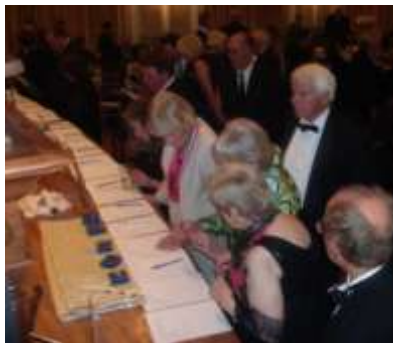
The Silent Auction - a highlight of our Stiftungsfest celebrations