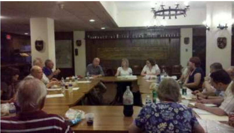
Our "Brown Bag Lunch" in the Ratskeller with this year's GHI Fellows was well attended

In the short time at the Library, I checked about sixty readers and found a wide variety of school-books which reflect the changing