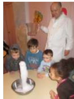
Science experiment and understanding states of matter

Children above the 3rd grade level go to the ABC Schützen 2, where emphasis is placed on free-flowing story-telling, reading, writing, public