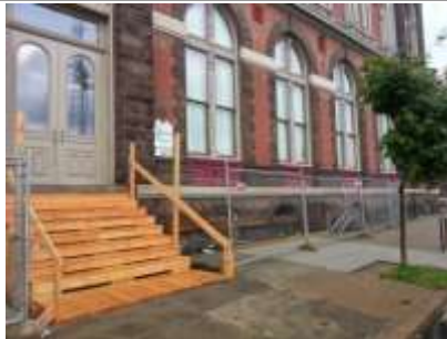
Temporary steps in front of main entrance.