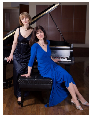
Estrella Piano Duo

Unfortunately, my computer connections did not produce a quality rendition of Claire Huangci's January 3, 2021 performance of the Beethoven Waldstein Sonata, No. 21 in C major, Opus 53, so I must confess to listening to a YouTube recording of her playing for a master-class, which was excellent, although it was not her most recent.