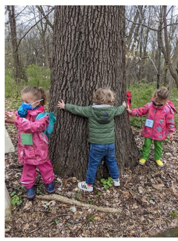
*This article is an example of the activities of a German Society affiliate. PhillyKinder is a separate PA 501(c)(3) corporation and not a component of the German Society of Pennsylvania.