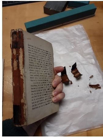
Adopted books from the Horner Memorial Library collection undergoing restoration by The Book Restorer.

of Pennsylvania 611 Spring Garden Street Philadelphia, PA 19123 215-627-2332 info@germansociety.org www.germansociety.org