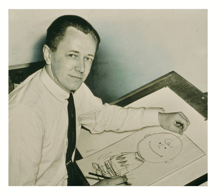
Charles M. Schulz in 1956, with a drawing of Charlie Brown. The Peanuts comic strip made its debut in October 1950.